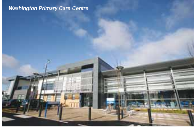
Washington Primary Care Centre