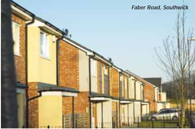
Faber Road, Southwick